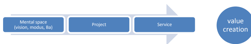
Fig. 1. Basic P2M Project Management Phases.

We are managing supportive structures of tasks, values, and demands (projects, processes, products, and ‘usefulness’). We could easily map that to a P2M project management phases: